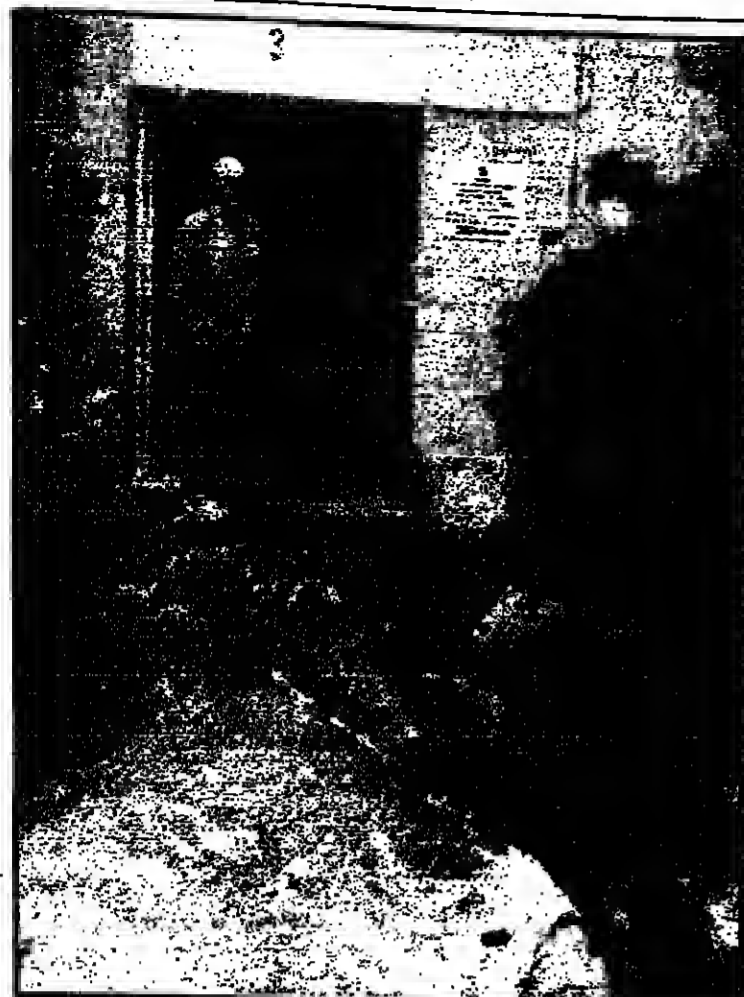
One elderly resident was slightly hurt yesterday when she tried to cross this ditch dug by the Israel Electric Corporation in Jerusalem's Rehavia neighborhood. An IEC spokesman said the ditch, which made entering the building virtually impossible, was necessary to install electric cables.